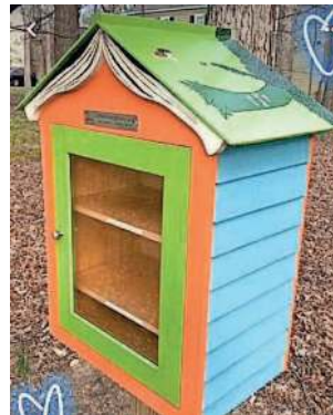
Coldwater Kiwanis and Branch District Library will install eight book boxes like these in eight location around Coldwater and Coldwater Township.